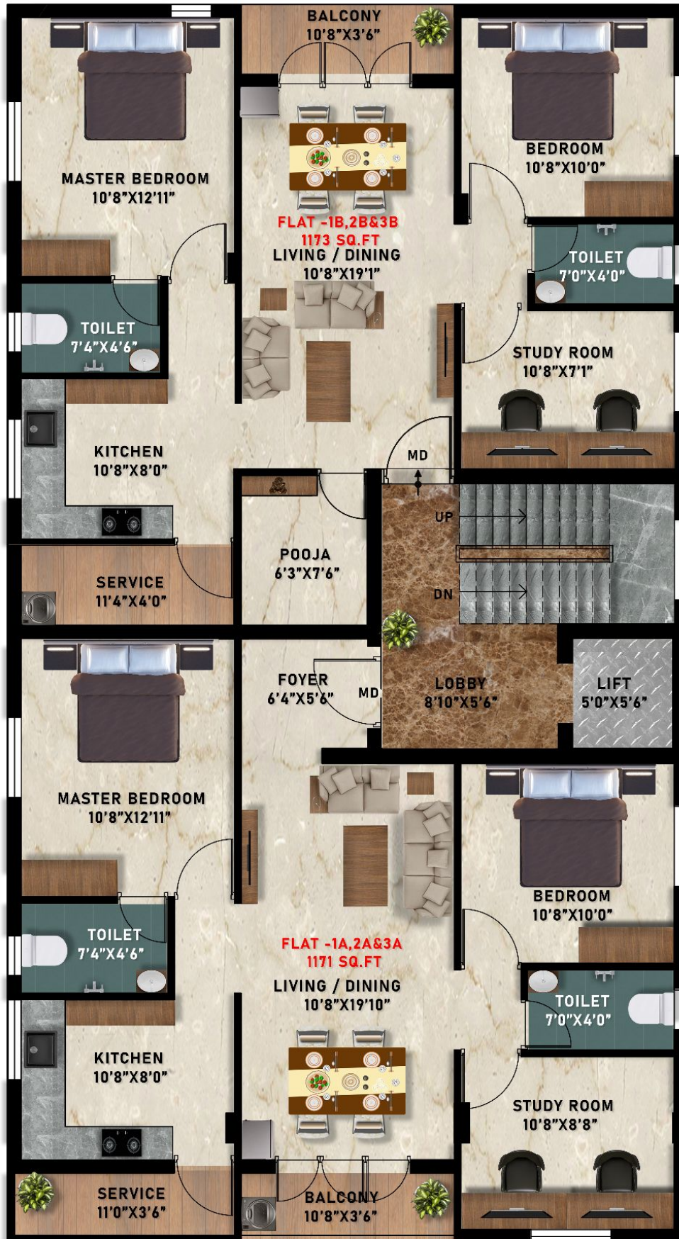
TYPICAL FLOOR PLAN (FIRST, SECOND & THIRD)